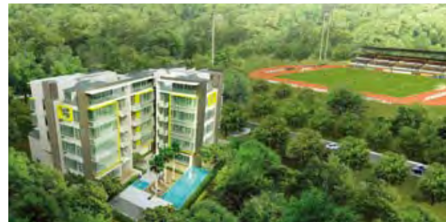
WEMBLY RESIDENCES - Yio Chu Kang Road (Apartment)