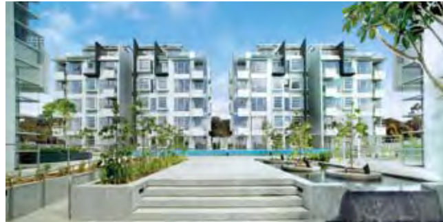
POSHGROVE EAST - East Coast Road (Condominium)