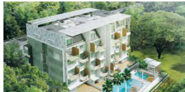
BALCON EAST - Upper East Coast Road (Apartment)