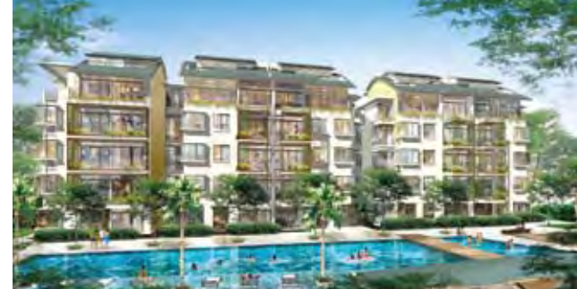
TREASURE PLACE - Chwee Chian Road (Condominium)