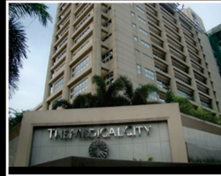
Medical City Hospital