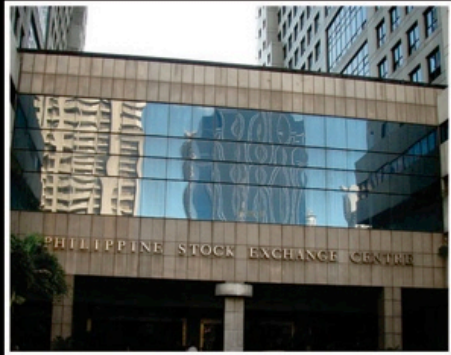
Philippine Stock Exchange Centre