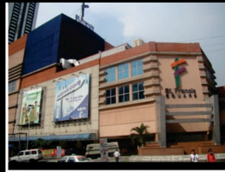
St. Francis Square Mall