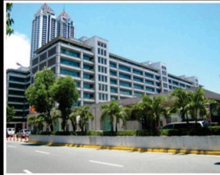
Asian Development Bank