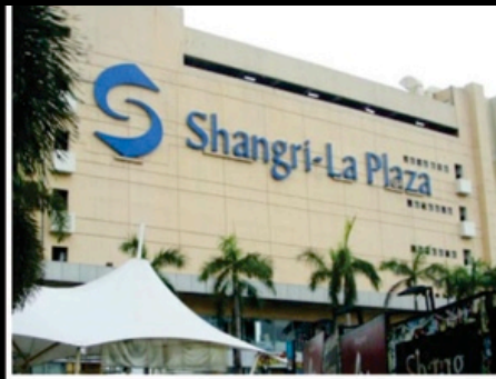
Shangri-La Plaza Mall