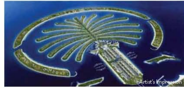
Palm Jumeirah Villas, U.A.E