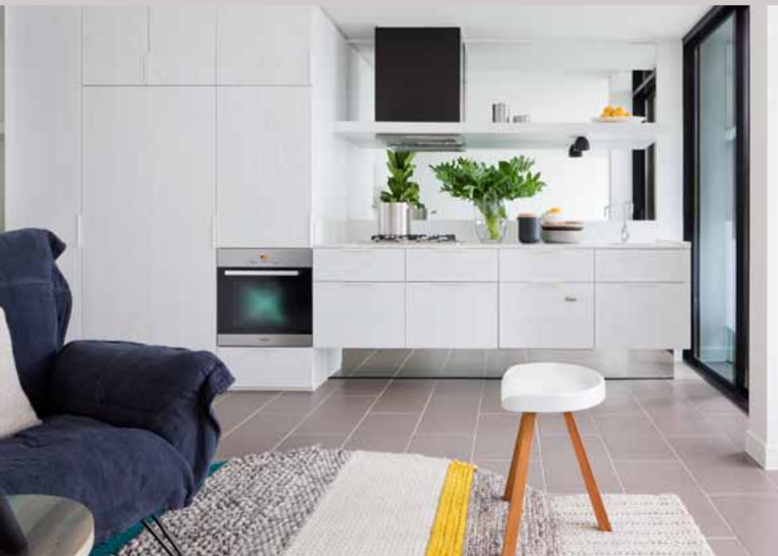
elm Melbourne, Australia

The elm development by Fridcorp draws inspiration from its adjacent tree-lined boulevard of St Kilda Road, on a prime site that was once home to a Melbourne television icon. Exuding a sophisticated style and beauty, elm features subtle, layered architecture, elements of art within the interiors and a podium level recreation deck.